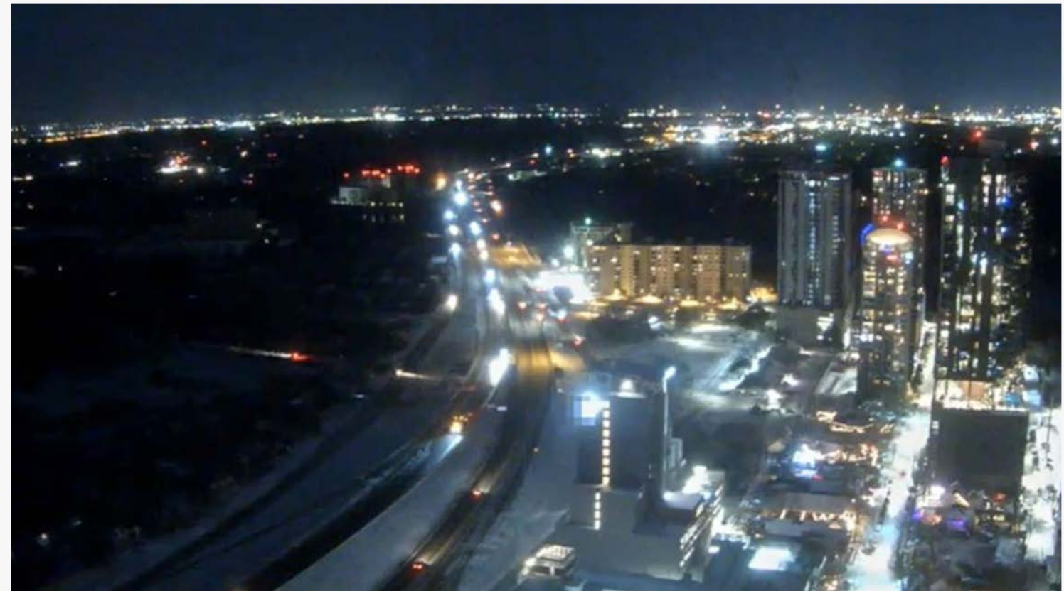
KVUE - February 16, 2021